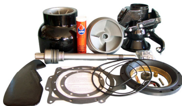
JACUZZI YJ, WY & PANTHER ENERGIZER KITS