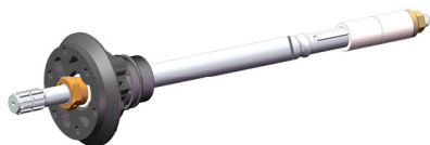
COMPETE SHAFT ASSEMBLIES INCLUDING HAMILTON 212

WE HAVE REPLACEMENT PARTS FOR: AMERICAN TURBINE, DOMINATOR LEGEND, BERKELEY JACUZZI & PANTHER ENERGIZER HAMILTON