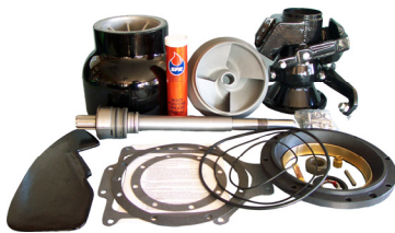
JACUZZI YJ, WY & PANTHER ENERGIZER KITS