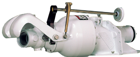
SD-309 W / HTR II

WE HAVE REPLACEMENT PARTS FOR: AMERICAN TURBINE, DOMINATOR AGGRESSOR, LEGEND, BERKELEY, HAMILTON JACUZZI ENERGIZER, PANTHER ENERGIZER